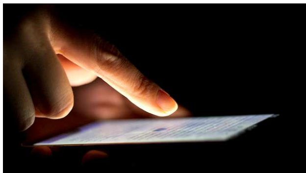
"Close up person using smartphone ".

We could all be vulnerable and need to know how to detect spyware on our phones.