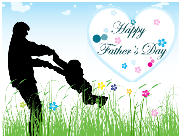
Father's Day

THE MISSION OF FAMILY GUIDANCE CENTER'S FIRST STEP DOMESTIC VIOLENCE PROGRAM IS TO PROVIDE NEEDED SERVICES TO VICTIMS OF DOMESTIC VIOLENCE AND TO INCREASE THE COMMUNITY'S AWARENESS ABOUT THE PROBLEM.