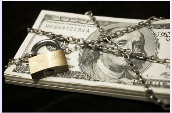
“Under Lock and Chain”

was on the home mortgage, but only her husband's was name on the deed. This meant she was equally responsible for the mortgage payment, but had no ownership, whatsoever, of the home. Another victim was blocked from the family bank account, which she'd used for twenty years, when she left her abusive husband – the account was only in her husband's name. Financial abuse is a powerful weapon in preventing victims from leaving the relationship.